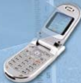
Typical text display of surcharge alarm.

INBOX SMARTCOVER ALARM SURCHARGE 115TH AND MAIN 12 IN 6:02:42 PM JUNE 5, 2007 ERASE REPLY OPTIONS